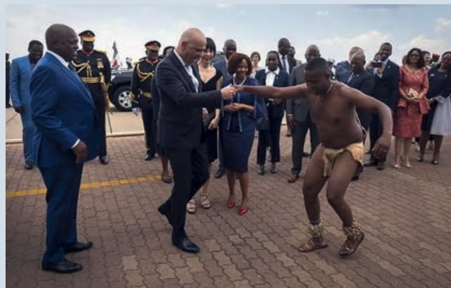
Berset (centre) was invited for a traditional dance during the official welcome ceremony in Botswana. Host Mokgweetsi Masisi (left) looks on.