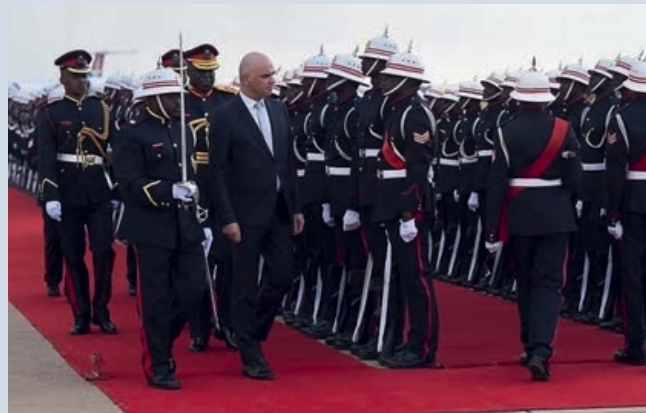
Berset was received with full military honours in Botswana.

It's the first official visit to Botswana by a Swiss president.