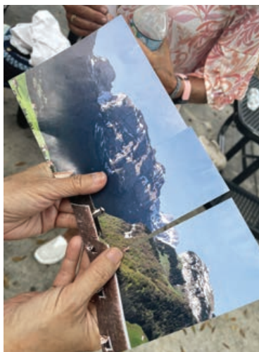
Putting together two pieces of the four-piece Swiss photo puzzle.

The highlight of the afternoon was a game that our members played which encouraged them to find