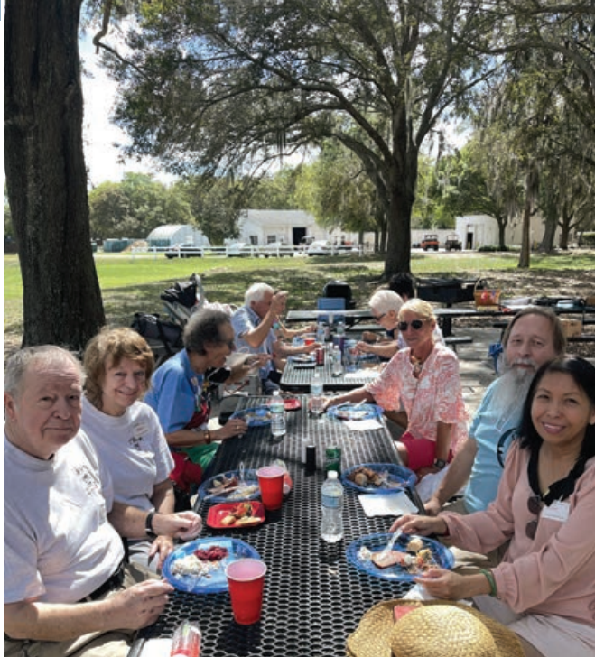
Enjoying a potluck luncheon in the shade of Cypress trees. Another beautiful Florida day!

A beautiful spring day was the backdrop for our Annual Meeting which was preceded by a delicious potluck luncheon. About 25 members enjoyed several typical Swiss dishes under the canopy of Cypress trees while catching up with old friends and meeting our youngest members, Elina (5 months) and Aurelia (25 months).